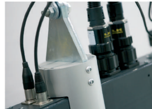
Quick lock connection for easy and fast installation.