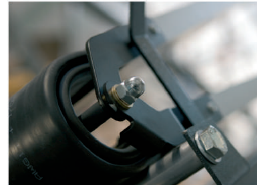
Flip-Flop Cable Management.