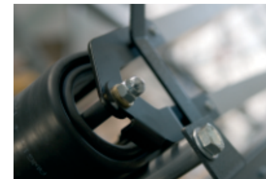
Flip-Flop Cable Management.