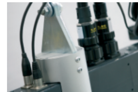
Quick lock connection for easy and fast installation.