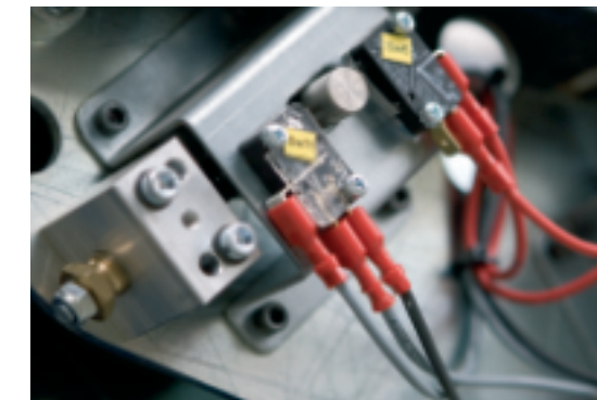
All safety micro-switches integrated into motor unit.